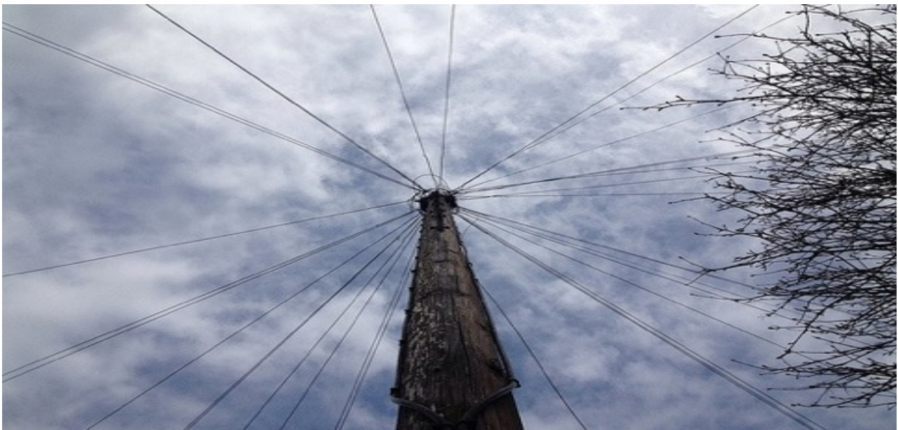
Wires, London April 2013.

Winston Churchill Memorial Trust Fellowship